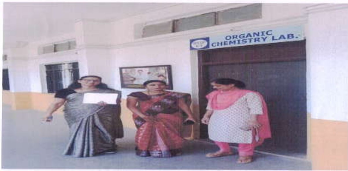
Visit to Pharmacy Lab:16/04/22