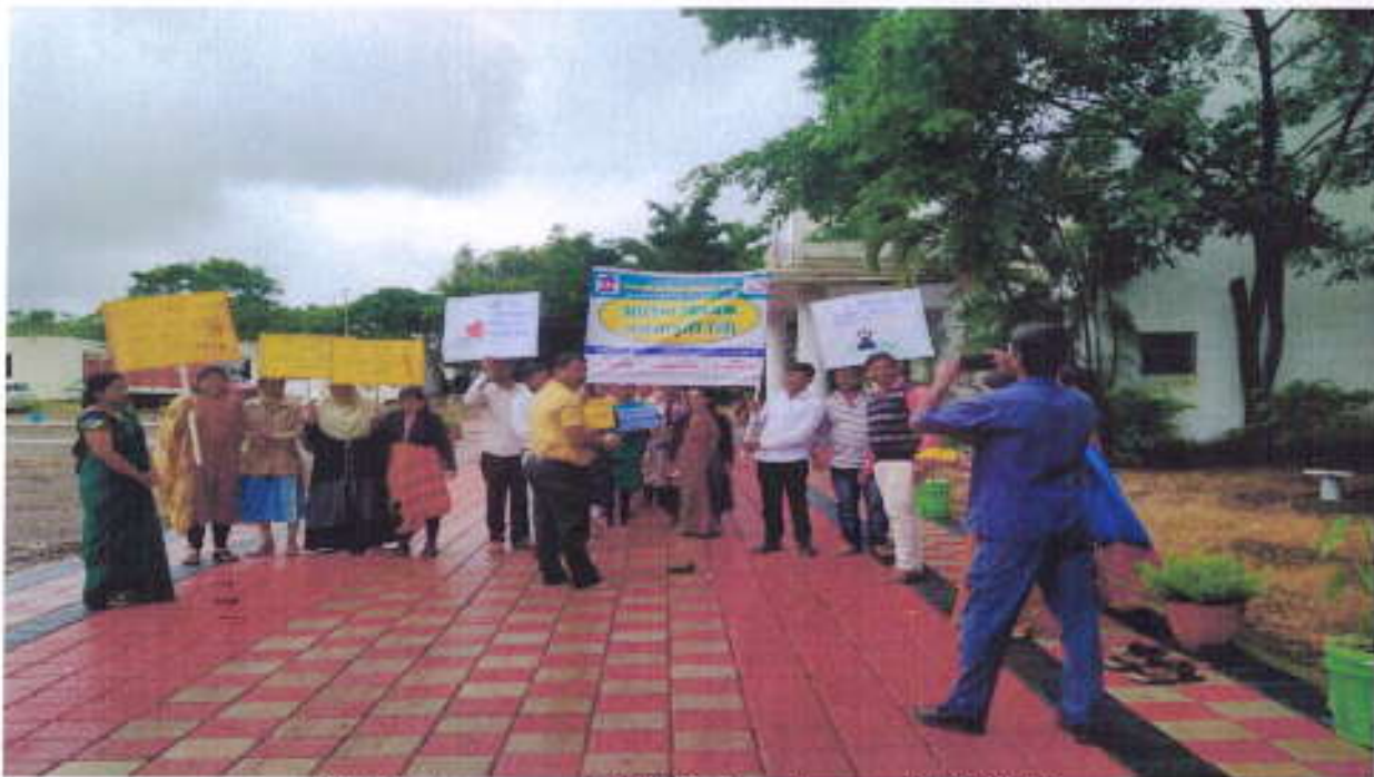
Health Awareness Rally in Dumberwadi:10/06/22