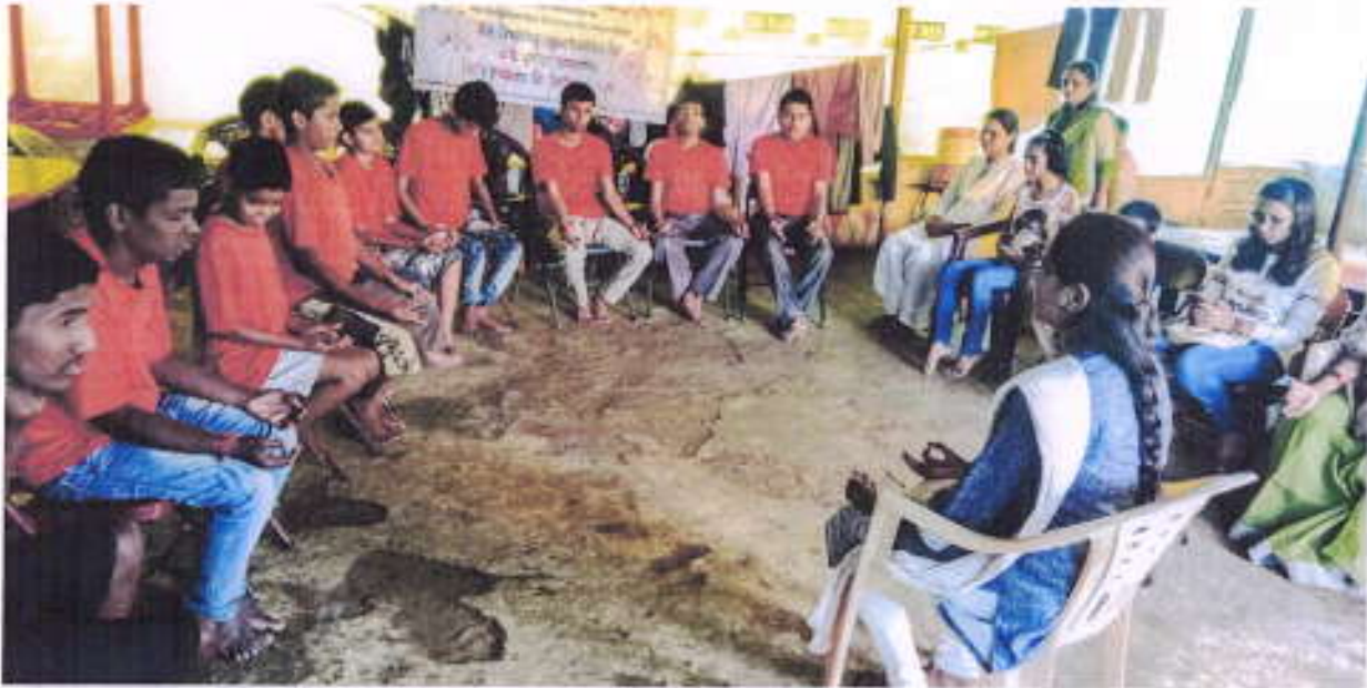
Visit to Special School: 25/10/2018