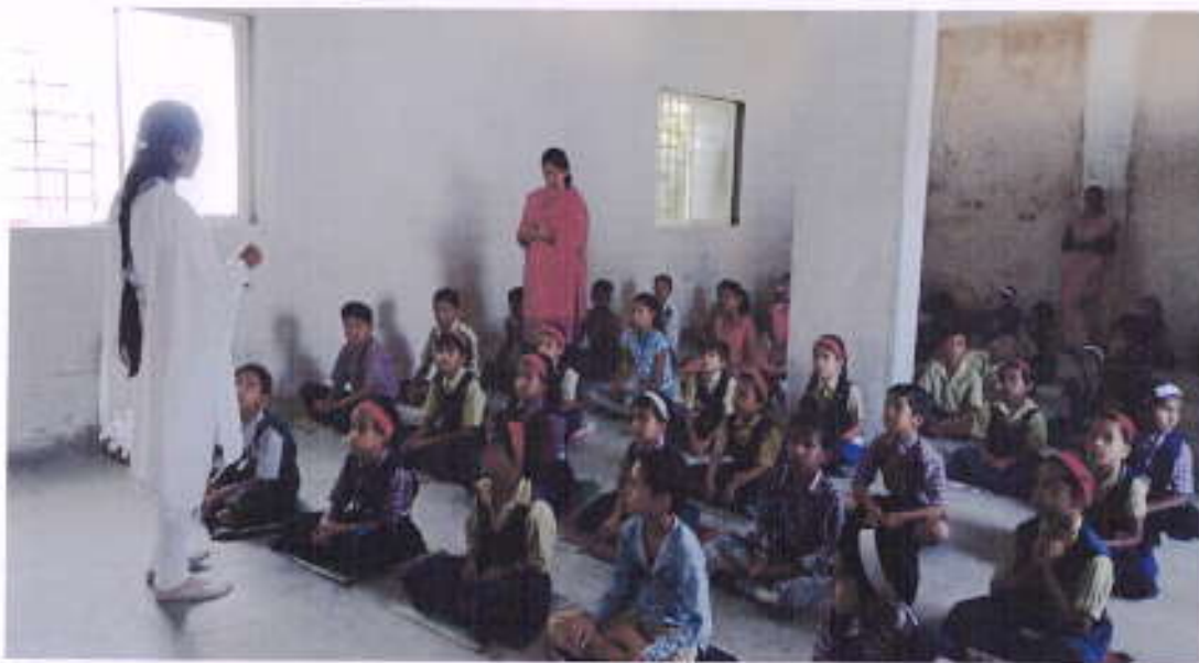
Health and Hygiene Guidance for Tribal Students:25/11/17