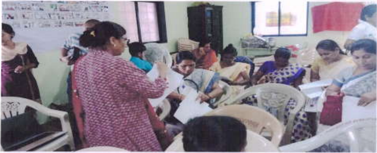
Community Work :9/12/18