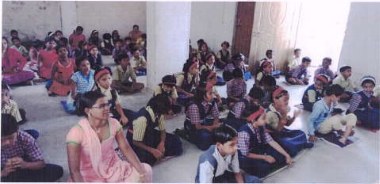
Teaching Tribal Students of Dumberwadivillage:2/11/17