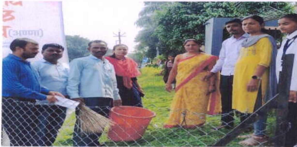
Cleanliness Program ,Dumberwadi, Otur:10/04/22