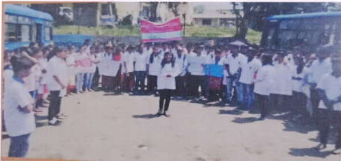
Human right Day –right to vote . Street play10/12/17