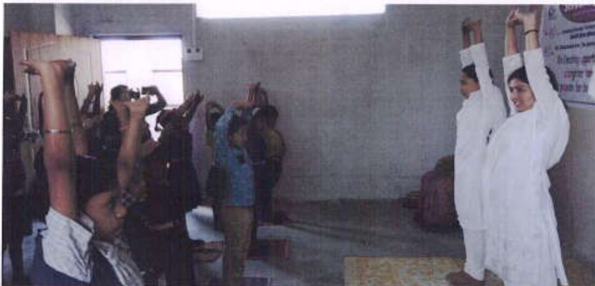
Yoga with Dumberwadi Primary School Children: 26/06/19