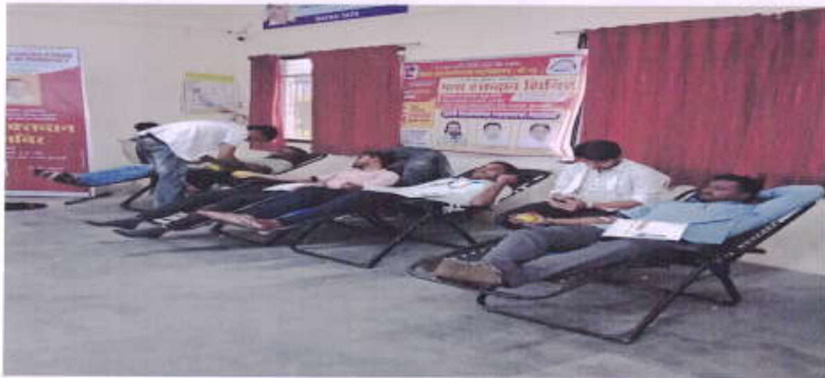
Blood Donation Camp in Dumberwadi 07/04/22