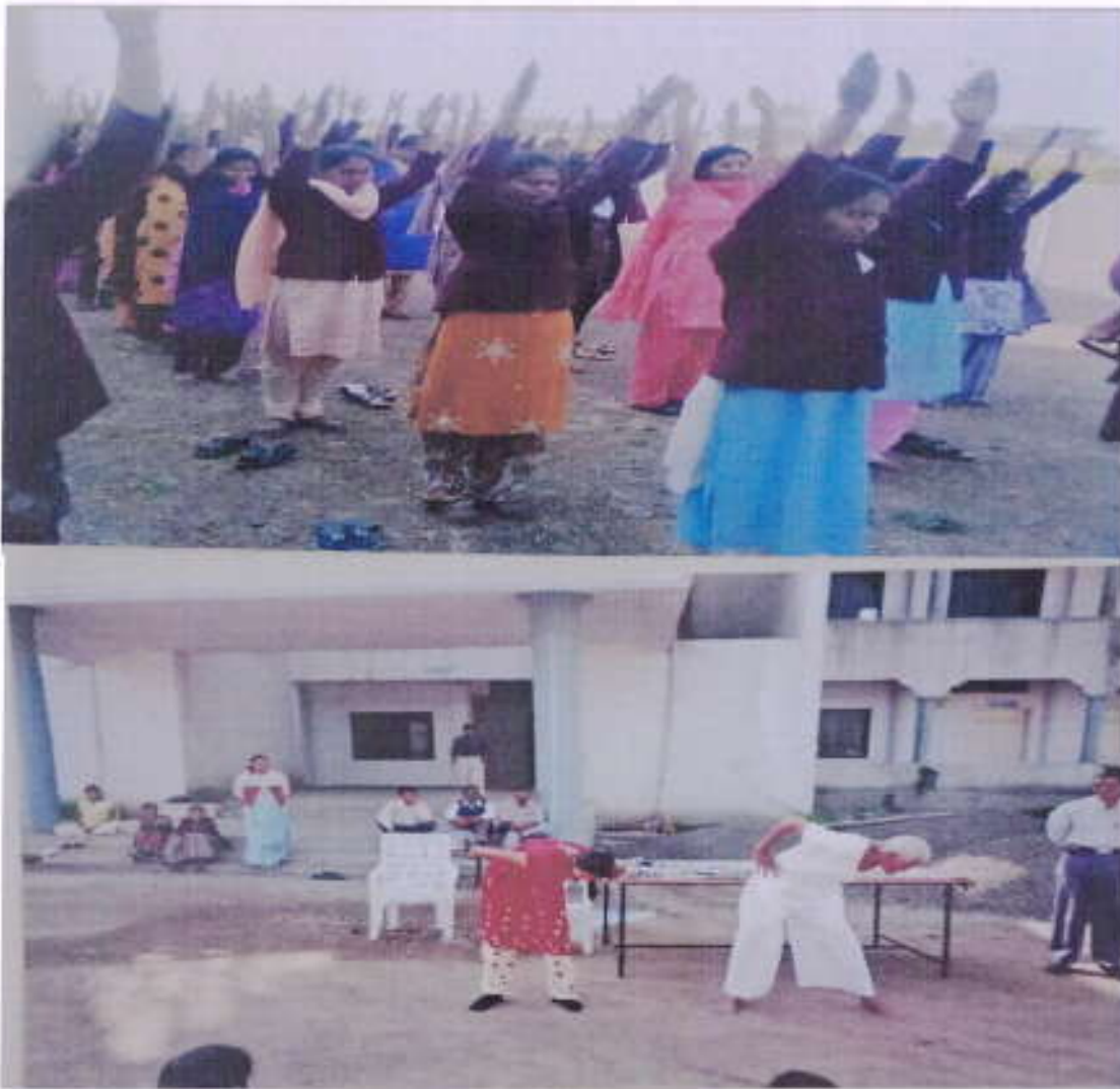
International 'Yoga Day' Celebration 21/06/2017