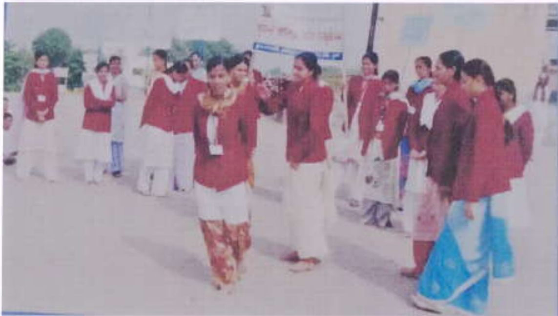
Rashtriya Ekta Diwas Street Play 31/10/18