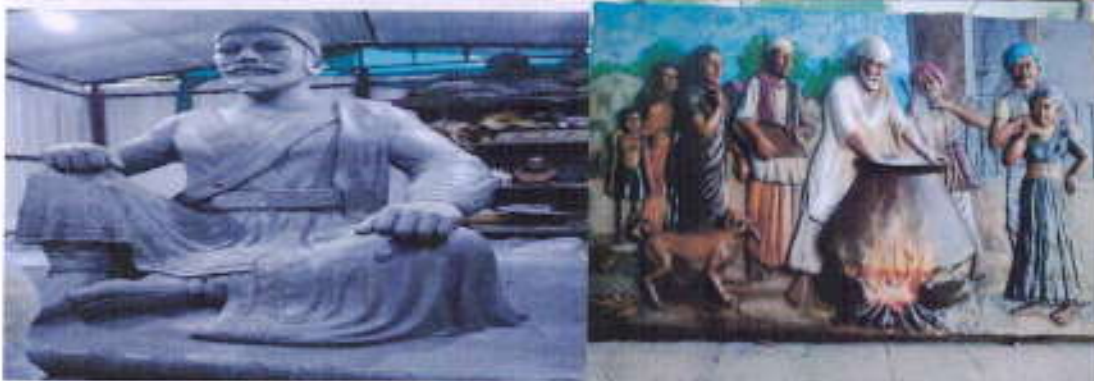
Visit to Yatin Arts Sculpture Studio Museum:4/12/19