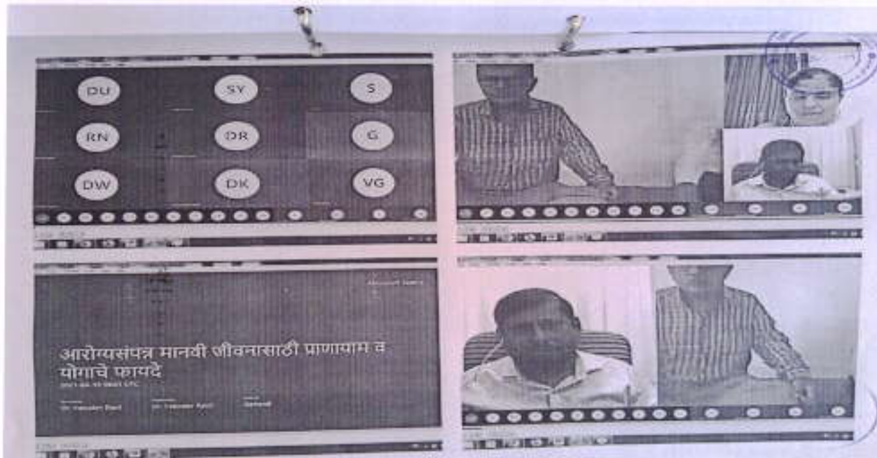
Online Yoga Celebrations:19/6/21