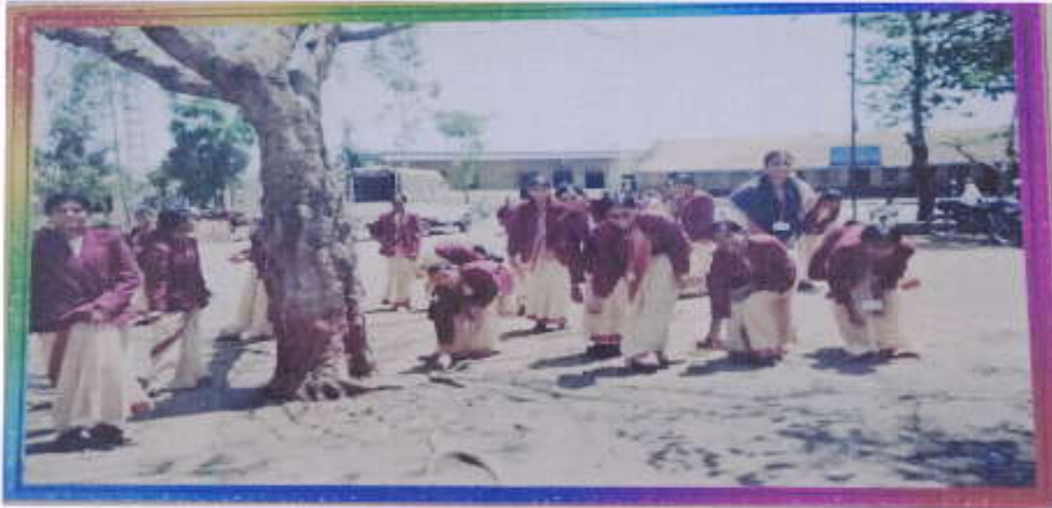
Gram Swacchata Campaign at Dumberwadi,Otur:1/10/17