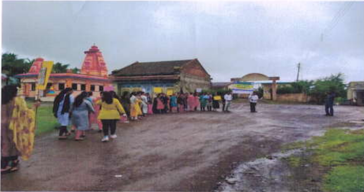
AIDS awareness Rally:1/12/17