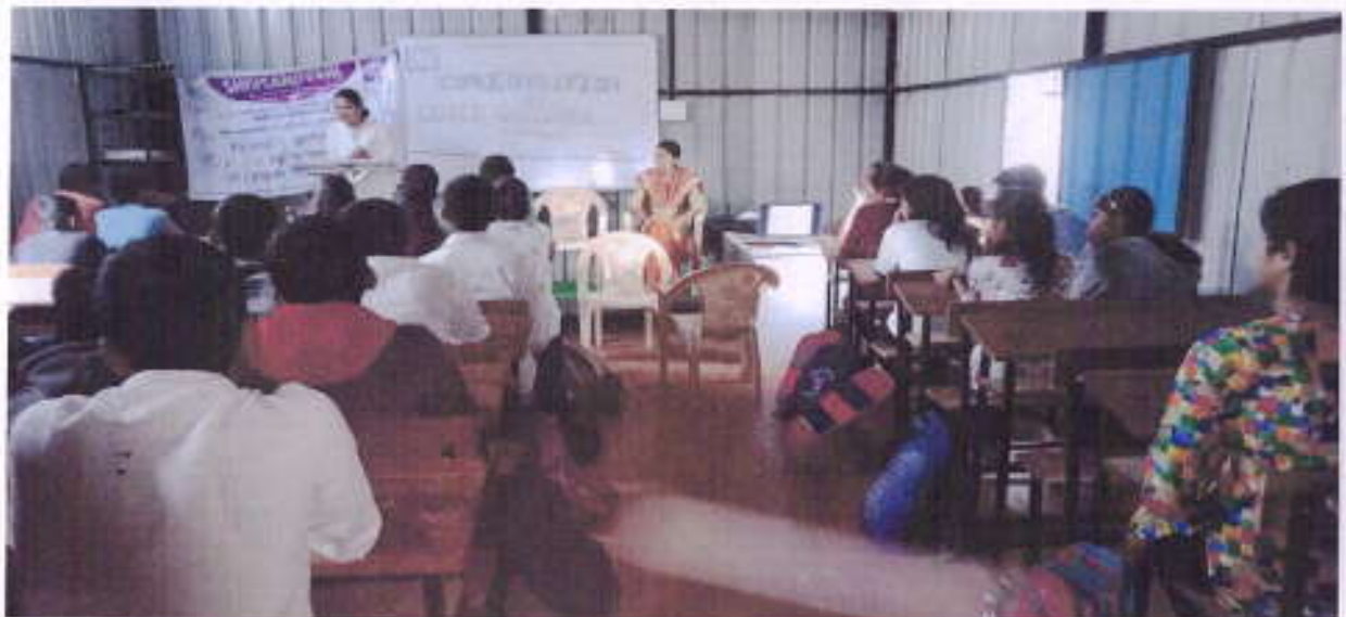
Concentration And Career Guidance:30/05/22